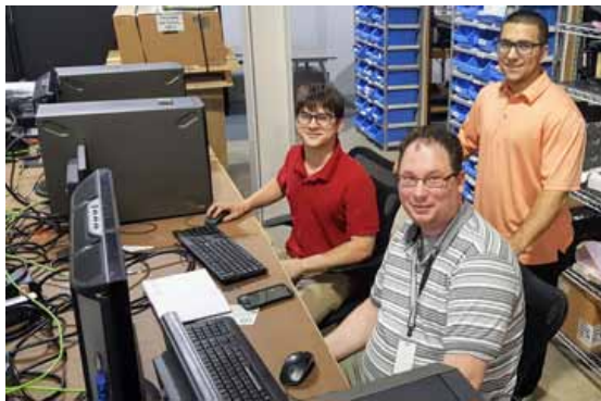
Bay Pointe Technology welcomes three new engineers to their fast growing company.